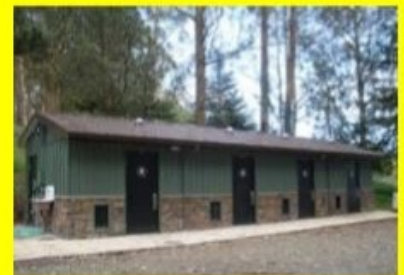
Renovate the southside shower house

More information will be coming as we begin to raise fund to make significant improvements to CWS. We cannot make this happen without the full support of the Region. Watch your inbox and the eNews for updates along with the cciwdisciples.org website.