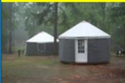
Replace current shelters with yurts

These are exciting times at Camp Walter Scott! A strategic plan was recently developed for the camp and the Region is read to start implementing the plan. For the strategic plan to succeed and for Camp Walter Scott to Flourish, We Need Your Help!!! So how can you help? Pray...Give...Plan a Visit To Camp...Get Involved