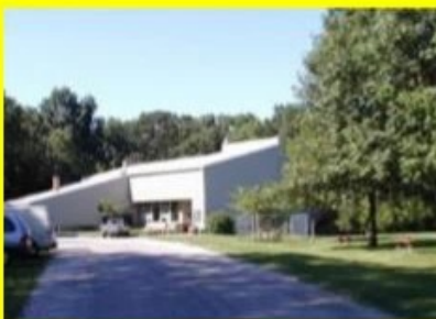
Replace the Dining Hall roof