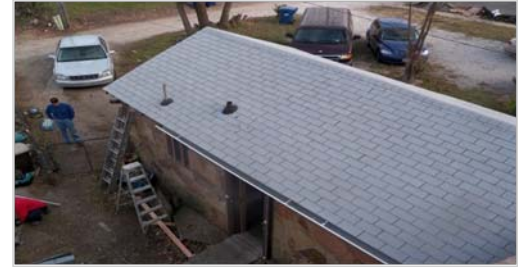
View of the finished roof .—Mark Johnson

shingles out, nailing, keeping shingles and nails supplied, working on the ground cleaning up or handing things up to the roof as needed. As we put the last nail in and the gut- tering on, the sun came out! God was pleased.